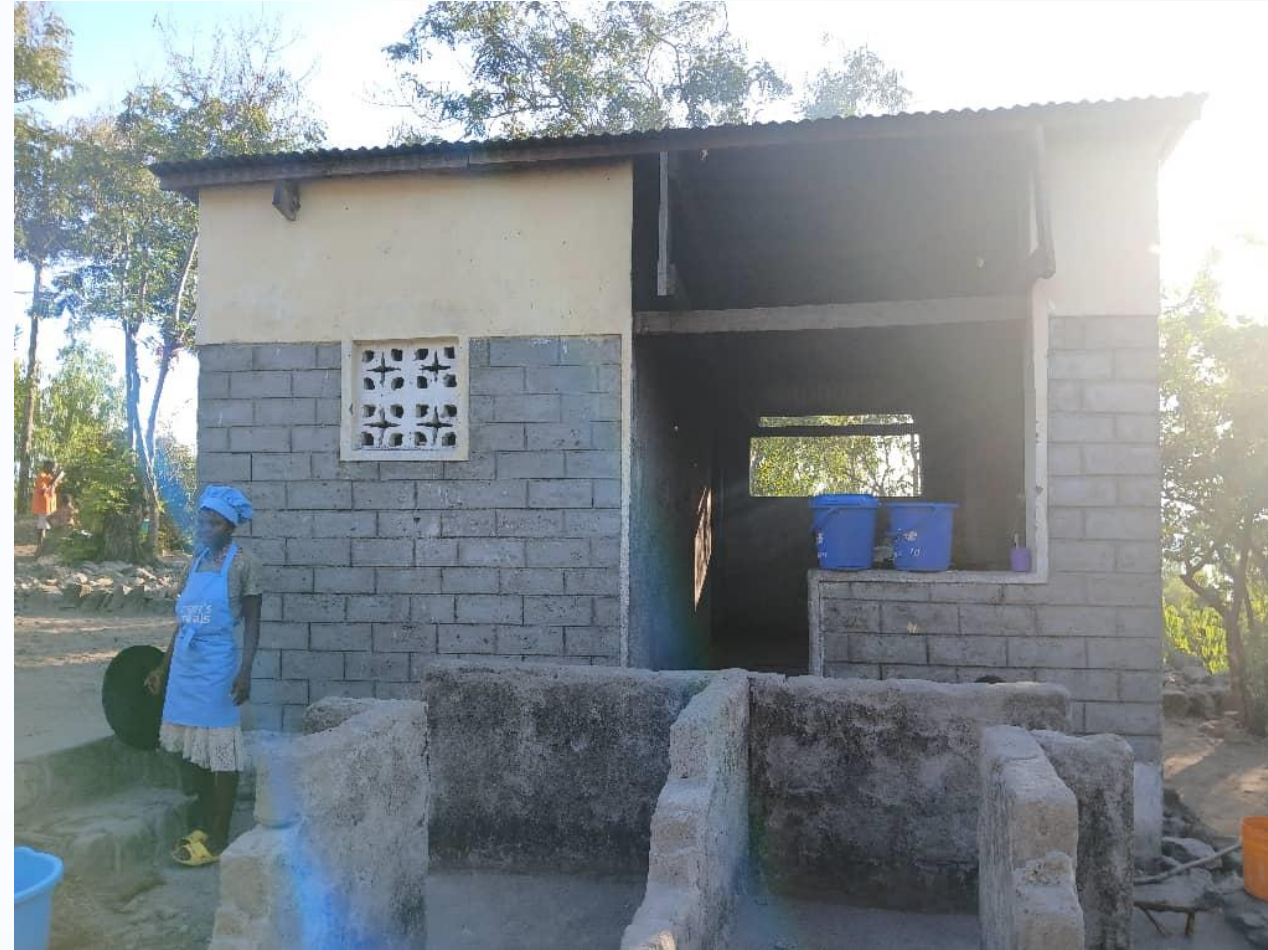
Chiteko school kitchen